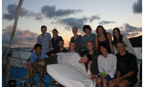
A brief break from solar car building aboard Habibi in The Whitsunday Islands

We arrived in Darwin on Tuesday 22nd September where we met Endeavour after her journey across land from Sydney. CUER received a very warm welcome from our hosts here in Darwin, BOC. They have provided us with the crucial and much appreciated workshop and office space. Huge thanks are also due to Virgin Atlantic who flew the chassis out from the UK and returned it to us without a scratch on it. We have also just received our solar array and bodywork from our sea freight container delivered via the port in Darwin. Well done to the