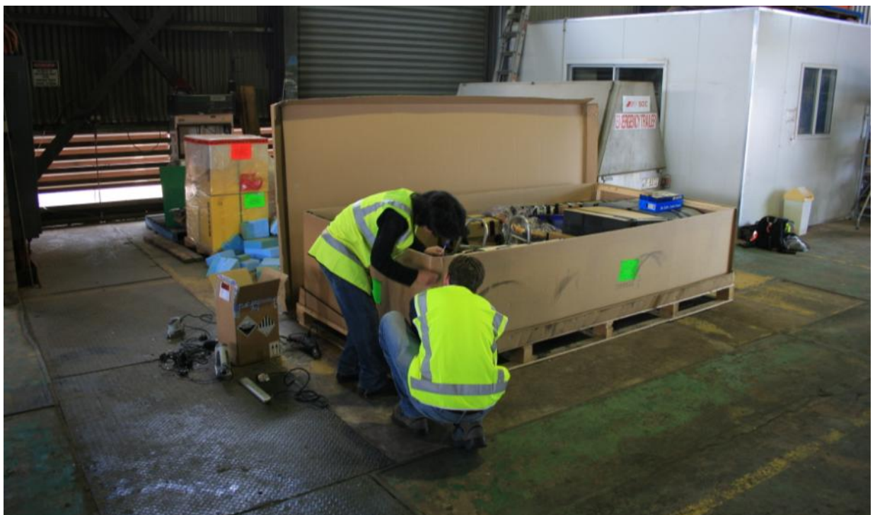
Unpacking our air crate box. Thank you, Virgin Atlantic!