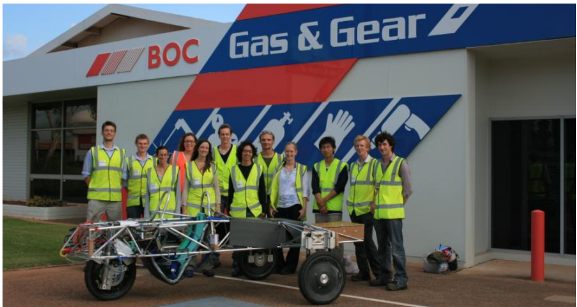
Endeavour and the team outside our wonderful workshop facilities at BOC in Winnellie, Darwin